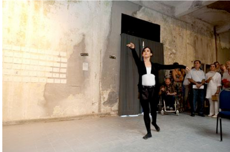
"As loose as anything." Performance by Ryan Gander during the opening of Manifesta 8. Curated by ACAF for Manifesta 8.

One of Europe's most unusual art events is Manifesta, a visual arts show that takes place every two years in a different location on the continent. This year the roving biennial is being held in the southern Spain city of Murcia in an effort to engage the region's blend of Islamic, Judaic and Christian cultural influences. The Murcia exhibit , the eighth of its kind, features some 150 artworks, installations and performances.